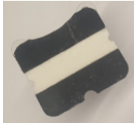
Gel Electrode Layer

The closer the antenna is to the skin, the more antenna impedance mismatching problems occur. In such cases, careful antenna design and matching should be done. It is wise, however to distance the antenna as much as possible from the skin.